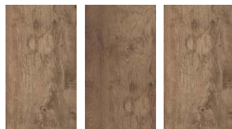
Arden Grove Walden