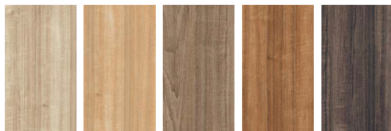
Atlantic Boreal Tropical Teak Ebony

Applications: Commercial & residential indoor floors & walls and surfaces including boats, buildings, foyers, boutiques, galleries, living areas, kitchens and bathrooms, plus all wall applications, splashbacks, bench tops, wall facades, lift cars and external walls (inclusive of wall cladding).